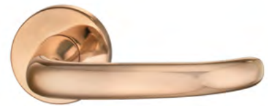
7305 Polished Waxed