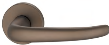
0510 Medium Bronze Coloured