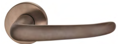
7625 Dark Patinated Waxed