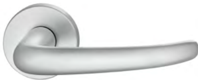
0105 Polished Silver Anodised