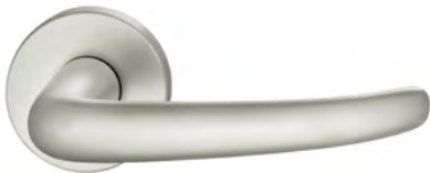
0205 Satin Anodised