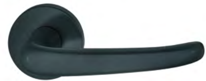
8802 Anthracite Grey