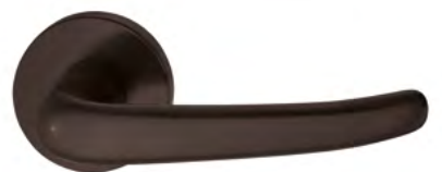
8821 Grey Brown