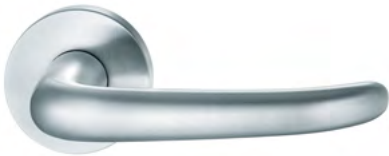
6204 Brushed Satin Matt