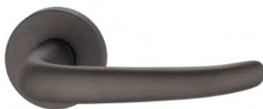
0710 Dark Bronze Coloured