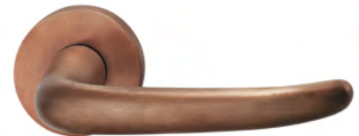
7615 Bright Patinated Waxed