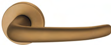
0410 Bronze Coloured