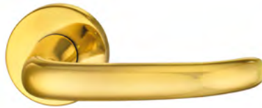
4205 Polished Lacquered