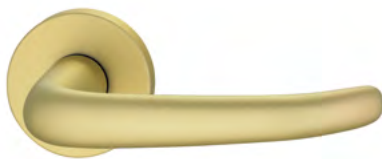
0310 Brass Coloured